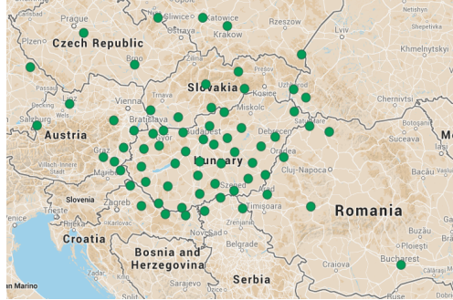
Selected stations inside AROME-Hungary domain by whitelist procedure (similarly as previous static bias correction study)