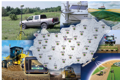
Hungarian so called SGOB GNSS ground-based receiver station network used in VARBC study

After the successful compilation of the above mentioned two userpacks, assimilation runs were executed to verify the correctness of the VARBC for ZTD with the new binaries. For the preliminary runs and for the longer passive assimilation experiments as well, Hungarian AROME configuration and GNSS ZTD observations from E-GVAP SGOB network were used (ZTDs from SGOB network were tested also with static bias correction approach in previous Hungarian impact studies). At first only one predictor has been set for ZTD observations which was the predictor 0. The modifications were validated through one or two updates of the VARBC parameters where VARBC ASCII files and diagnostics in NODE files were checked. It is worth mentioning that cycling of VARBC parameters can be done by daily update (24 hours) and also it is possible to make update by every analysis steps (e.g. with 3h RUC, 3 hours cycling of VARBC parameters).