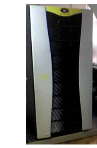
Figure 1. SGI Altix LSB-3700 BX2 Server with 24 Intel Itanium2 1.6GHz/6MB,

48 GB standard system memory, 2x146 GB/10Krpm SCSI disk drive,